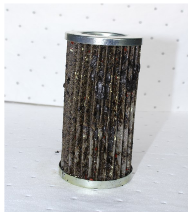
Samples of filters blocked with microbe